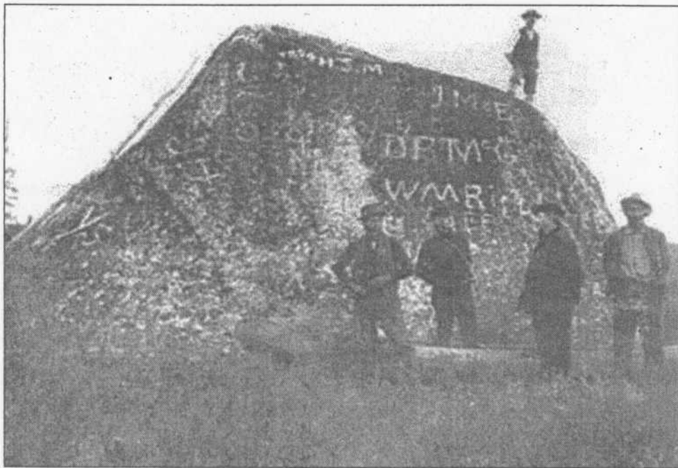
A group of travellers is pictured on Boundary Rock in 1888.